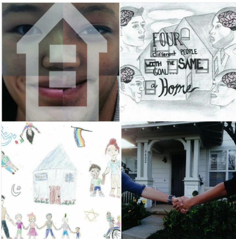
Winning artwork from "Fair Housing Is Our Kuleana" Art Contest 2015

June marked a landmark Supreme Court decision that confirmed disparate impact theory under the Fair Housing Act. Read below for more information and to learn about other recent fair housing news.