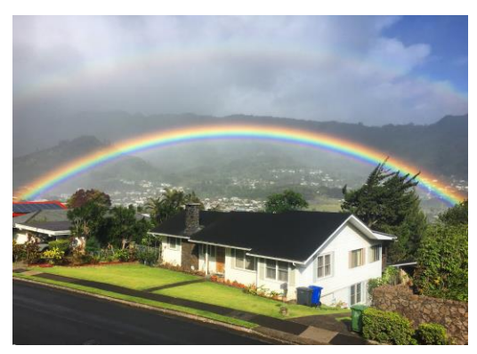
Mānoa Valley, O`ahu, Hawai`i