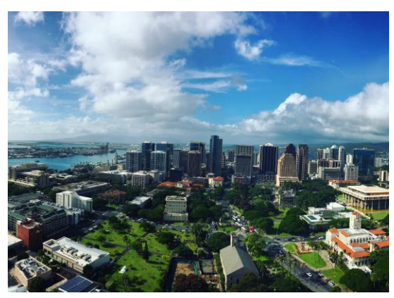
Downtown Honolulu, Hawai`i