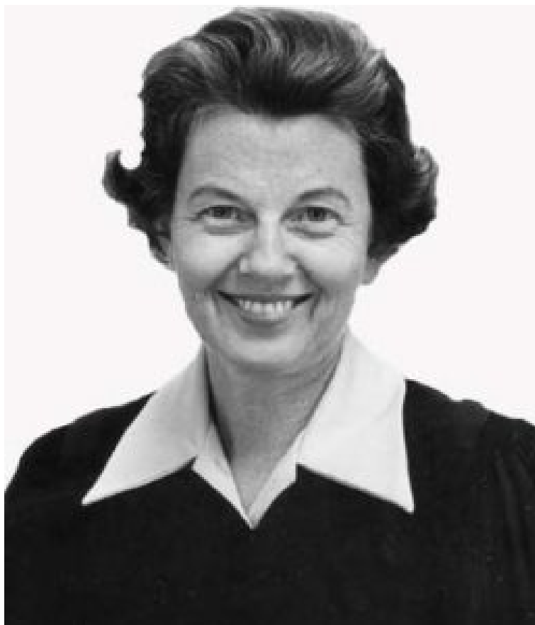
Judge Betty Vitousek

Mahalo nui loa to Judge Betty Vitousek (1919-2017)