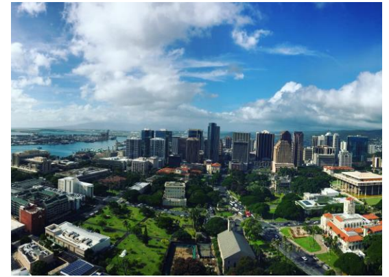
Downtown Honolulu, Hawai'i