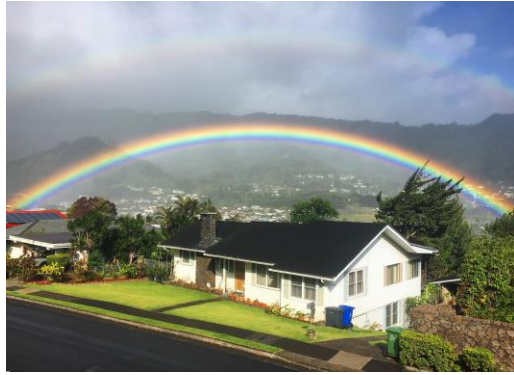
Mānoa Valley, O`ahu, Hawai`i